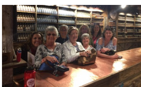
Great job by the Dames and Voyageurs of Tennessee