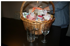
What a great time and wonderful Southern Hospitality at the Southland Dixie.