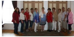
Good times at the Great Western States Promenade in Tombstone, AZ