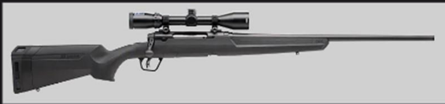
SAVAGE ARMS AXIS II XP 270WIN W/ BUSHNELL SCOPE