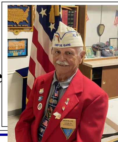
INSIDE THIS ISSUE