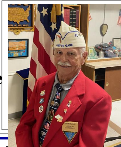
INSIDE THIS ISSUE