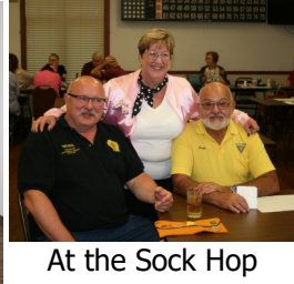
At the Sock Hop